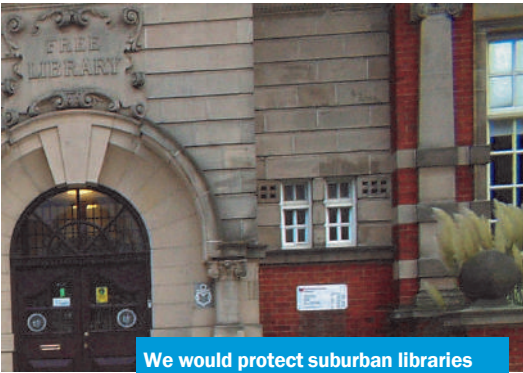
We would protect suburban libraries

Programmes have not taken place and the concierge and night time security service is now under threat of removal.