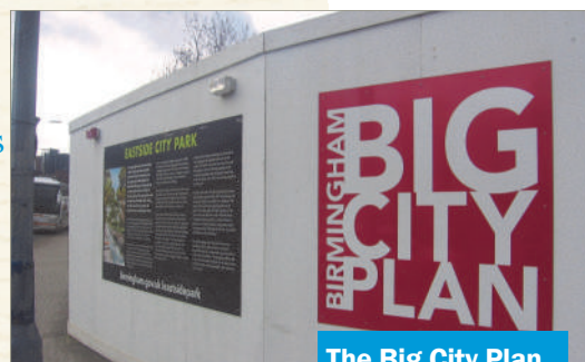
The Big City Plan introduced by the Conservatives